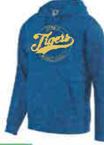
Augusta Sportswear 60/40 Fleece Hoodie