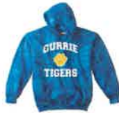
Tie Dye Pullover Hoodie