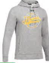
Under Armour Hustle Fleece Hoody