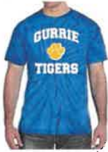
Tie-Dye Adult 5.4 Oz. 100% Cotton Spider T-Shirt

Online Store Deadline: Sunday October 17th, 2021 (11:59pm CDT)