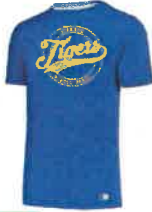
Russell Athletic Essential Tee