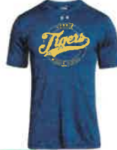
Under Armour Short Sleeve Locker Tee 2.0