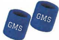
Bememo Sports Wristbands (2 pieces)