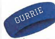
Bememo Sports Headband