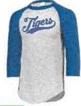
Augusta Sportswear Baseball Jersey 2.0