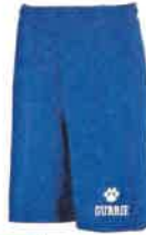
Russell Athletic Dri-Power® Essential Performance Shorts With Pockets