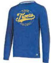
Russell Athletic Essential Long Sleeve Tee