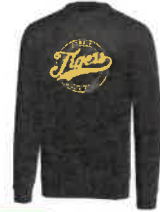
Augusta Sportswear 60/40 Fleece Crewneck Sweatshirt