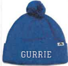
Pacific Headwear Knit Fold Over Pom-Pom Beanie