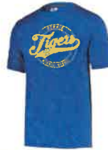
Russell Athletic Dri-Power Core Performance Tee