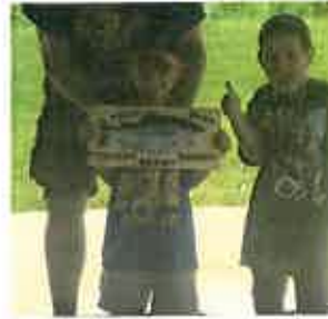
Fishing Derby Champ