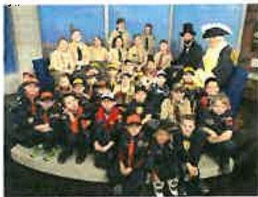
Cub Pack 3177 on WGN-TV

--This summer we are having our annual fishing derby and we're CAMPING ON A SUBMARINE! --We also do many service projects in the community. We have been doing a Thanksgiving Food Drive in our community for more than 60 YEARS!!