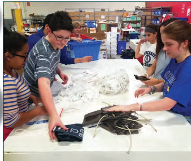
IN FEBRUARY, EMM MEMBERS SORTED MEDICAL SUPPLIES FOR PROJECT C.U.R.E. IN WOODRIDGE.