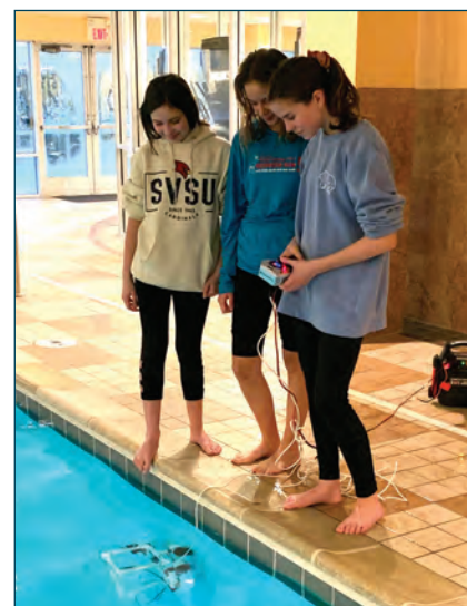
MEMBERS OF THE UNDERWATER STEM CLUB TEST AN ROV (REMOTELY OPERATED VEHICLE).

Fourteen students are members of the Underwater Robotics STEM Club and have been busy building, flying and practicing four Remotely Operated Underwater Vehicles (ROVs) for two competitions, including an intramural, where they will compete with three other teams. The winning team will advance to the Midwest Regional competition in April hosted by the Shedd Aquarium at Northeastern Illinois University in Chicago.