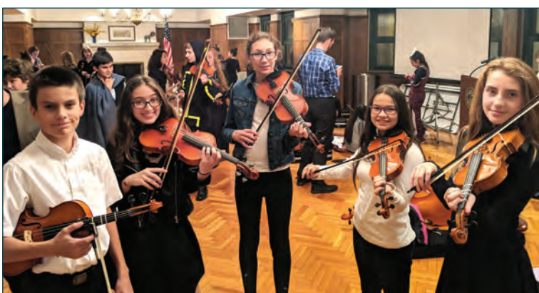
D105 OFFERS MANY OPPORTUNITIES FOR STUDENT MUSICIANS TO PERFORM OUTSIDE OF THEIR SCHOOLS.