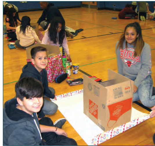
STUDENTS FROM ALL OF THE D105 ELEMENTARY SCHOOLS ARE COMING TOGETHER TO ENGAGE IN SERVICE PROJECTS.

In the fall of 2018, over 60 fifth- and sixth-grade D105 students again worked collaboratively to assemble and decorate food and supply boxes for the D105 Care Closet. Because of this initiative and food drives at each school, over 20 families received food and personal items for the holiday season.