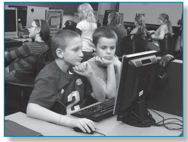
The newsroom: Spring Avenue reporters work on their articles.

• Do their best work and be willing to edit their own articles and articles written by other students.