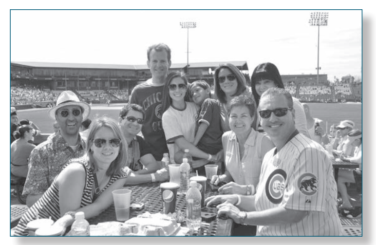
The new District 105 Foundation kicked-off with a day of fun at the Kane County Cougars ballpark. Pictured are just a few of the 600+ people from District 105 who enjoyed the baseball game and other special activities.

Through the District 105 Foundation, we will continue organizing events to bring our communities together and seeking sponsorships for these events to raise funds to support scholarships. For more information about our District 105 Foundation, please consult our District 105 website, www.d105.net .