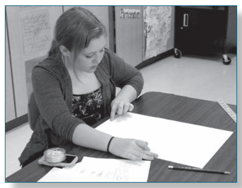
Drawing will be one of the Visual Arts courses

Over two years ago, the district created a program committee to investigate the effectiveness of specific programs, including the Gurrie Middle School exploratory curricu-