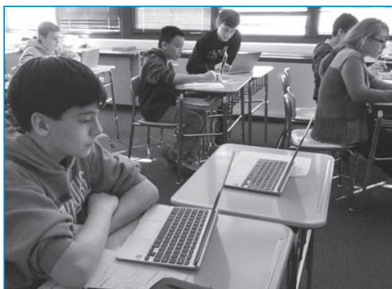
Every Gurrie Middle School student had access to a laptop this past school year. In the fall, the program will expand to sixth grade.

"The sixth grade staff will participate in professional development opportunities over the summer and throughout the next school year. These learning opportunities will focus on supporting staff with the 1:1 initiative, introducing new web-based tools, and exploring ways to deepen the implementation of tools such as Google Apps. Additionally, this initiative will increase access to technology district-wide and help all of our grade levels get closer to a 1:1 ratio."