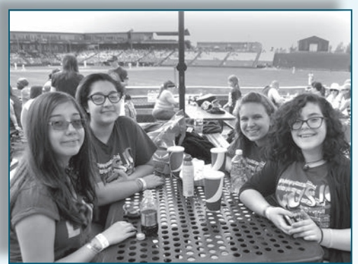
Fun was had by all at the fourth annual Kane County Cougars' Game on April 24. Over 600 community members attended the event.

The District 105 Foundation sponsored its fourth annual Kane County Cougars' Game on Sunday, April 24, as a way to strengthen family and community relationships throughout District 105. Once again, the event was a tremendous success with over 600 community members enjoying the game.