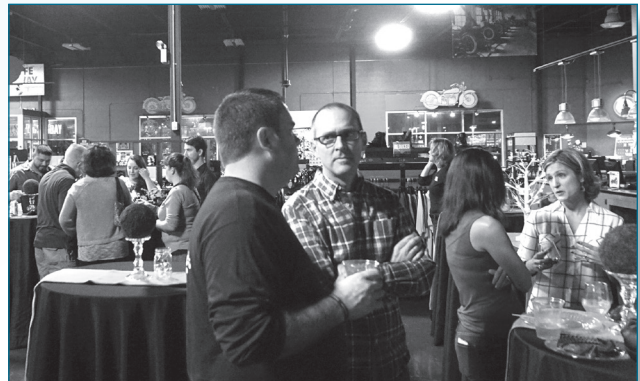
Over 200 attendees enjoyed the Grand Jam, the Foundation's very first fundraising event

Each year, the Foundation's focus is to award scholarships to five graduating LT students – former District 105 students – who are in need of support to pursue a college education. The Grand Jam raised over $20,000, which will be used to continue to support the Foundation's 18 scholarship recipients (their scholarships can be renewed annually), in addition to the next five recipients who will be named in May 2018. A milestone: the Foundation's first scholarship recipients will be graduating from college this spring, a proud accomplishment for the Foundation and for the D105 family!