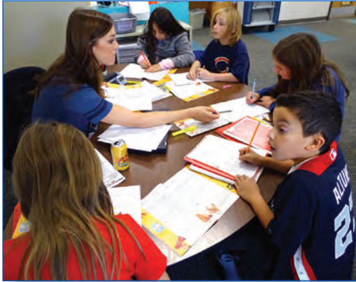
A TEACHER WORKS WITH A SMALL GROUP OF STUDENTS AT SEVENTH AVENUE SCHOOL

Seventh Avenue Building Leadership Team (BLT) met in August to dig deeper into both academic and social/emotional data points because of their commitment to ensuring success for all students!