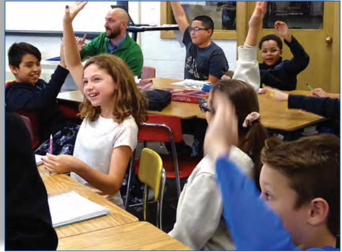
GURRIE MIDDLE SCHOOL STUDENTS ARE ENGAGED IN THEIR STUDIES.