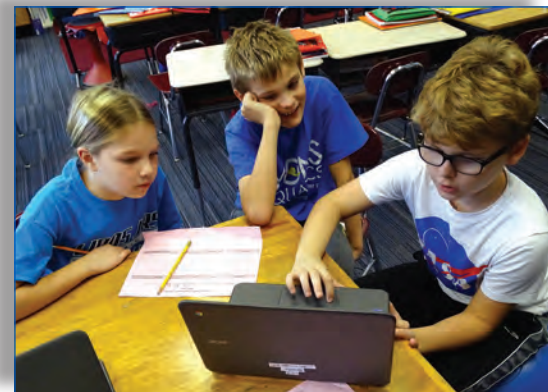
SPRING AVENUE STUDENTS WORK COLLABORATIVELY TO SOLVE A PROBLEM.

Through the above examples and by other means, we continually strive not only to challenge our students academically, but to help them develop critical thinking skills, creativity, and a sense of compassion and service to the world around them.