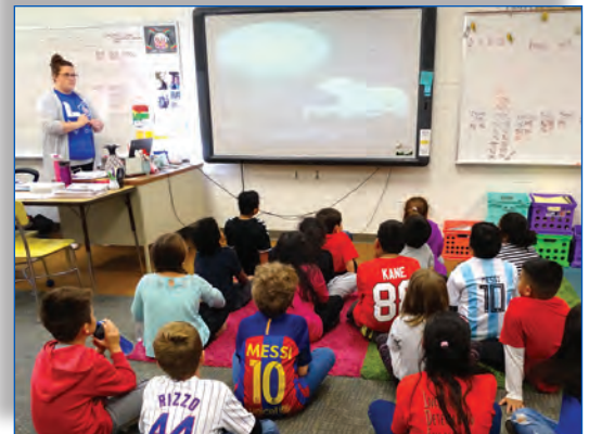
IDEAL SCHOOL STUDENTS VIEW A PRESENTATION.