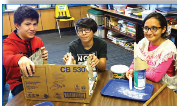
STUDENTS AT HODGKINS SCHOOL WORK ON A CREATIVE PROJECT.