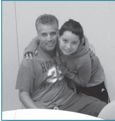
The Foundation's event gave families an opportunity to relax and have fun together.

The District 105 Foundation was formed in 2013 to strengthen family and community relationships throughout the district. These gatherings provide an opportunity for the community to enjoy spending time together, as students and families benefit from developing trusting relationships across elementary school attendance areas.